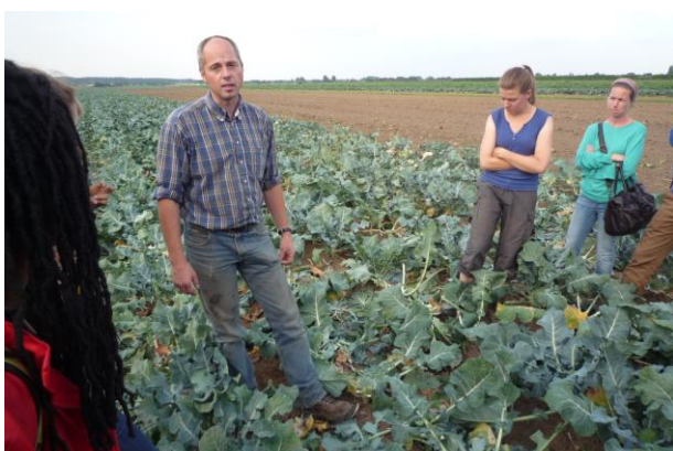
Author: Femke Hoekstra

De Stroom is an organic box scheme. Relationship: Face-to-face since consumers can purchase organic vegetables directly at a farm shop. But mostly it can be defined on the basis of spatial proximity since the (bags with) vegetables are retailed in the region of production and consumers are made aware of their origin.