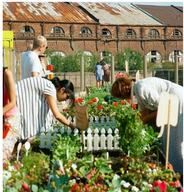
The vegetable garden of the LavkaLavka 6 .

LavkaLavka successfully collaborates with restaurants and chefs, and also tries to cooperate with shops, suppliers of equipment, seeds, fertilizers, forage, energy, etc.