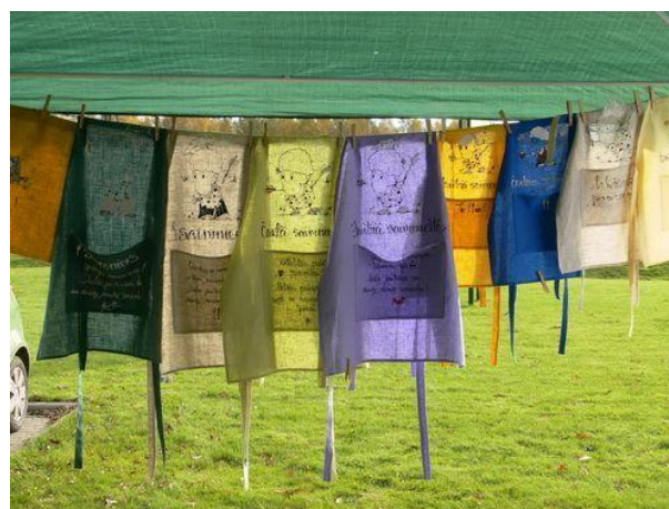
Author: Rudīte Vasile