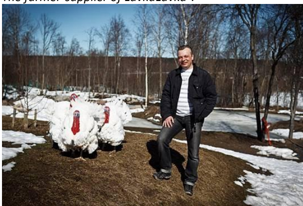
The farmer-supplier of LavkaLavka 5 .

For most of the farmers and the LavkaLavka employees it is the main/full-time activity. The manager of LavkaLavka said that they prefer to consider themselves not as a shop but as a cooperative or club of people having the same interests and way of life. The initial motivation of founders of the first Moscow branch of LavkaLavka was to get tasty farmers' products - they could not find them on the market and that is why they decided to go directly to producers (first for themselves and later, when they realized that there is demand for such products, for other consumers as well).